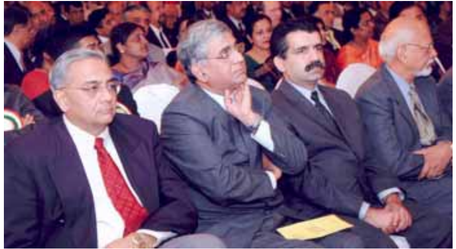
A section of the distinguished audience.