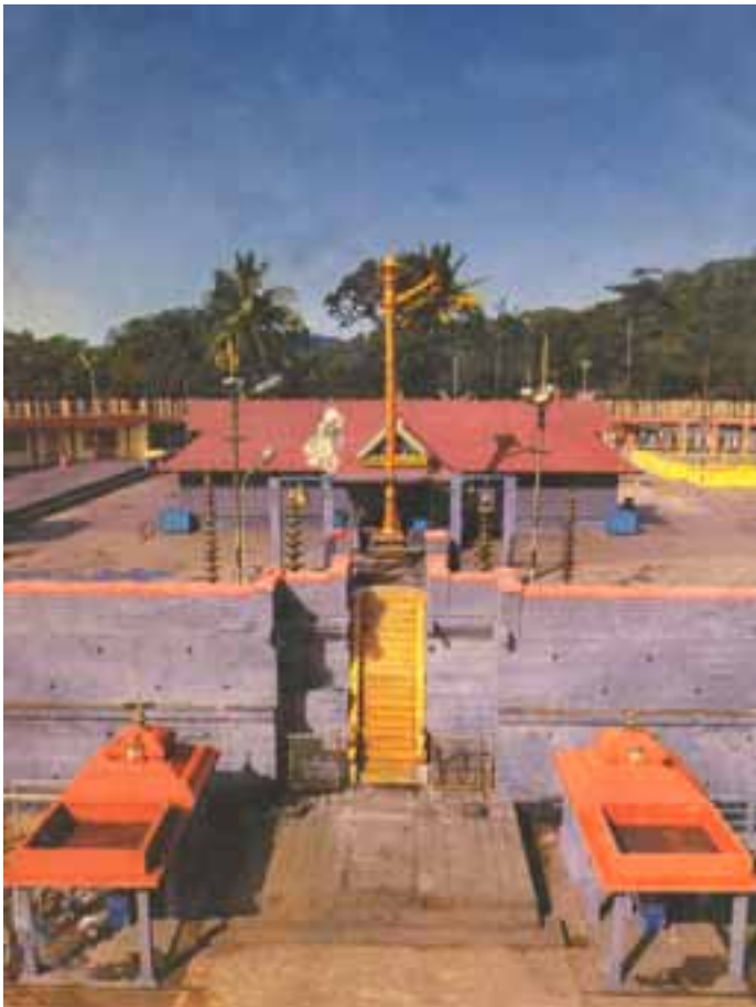
The Sabarimala Ayyappan temple.

The walk down is tougher than the climb up for two reasons. One, we were already tired because of the climb up. Secondly, when you walk down, the entire pressure is on the sole of the foot. The stones in the path make it tougher. Reached Pamba around 8; again broke a coconut each at the Ganesh temple.