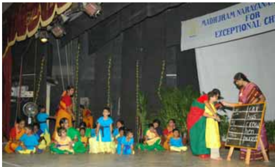
The children put up a spell binding show at the 15th Anniversary of MNC.

home-based programmes and consultancy services.