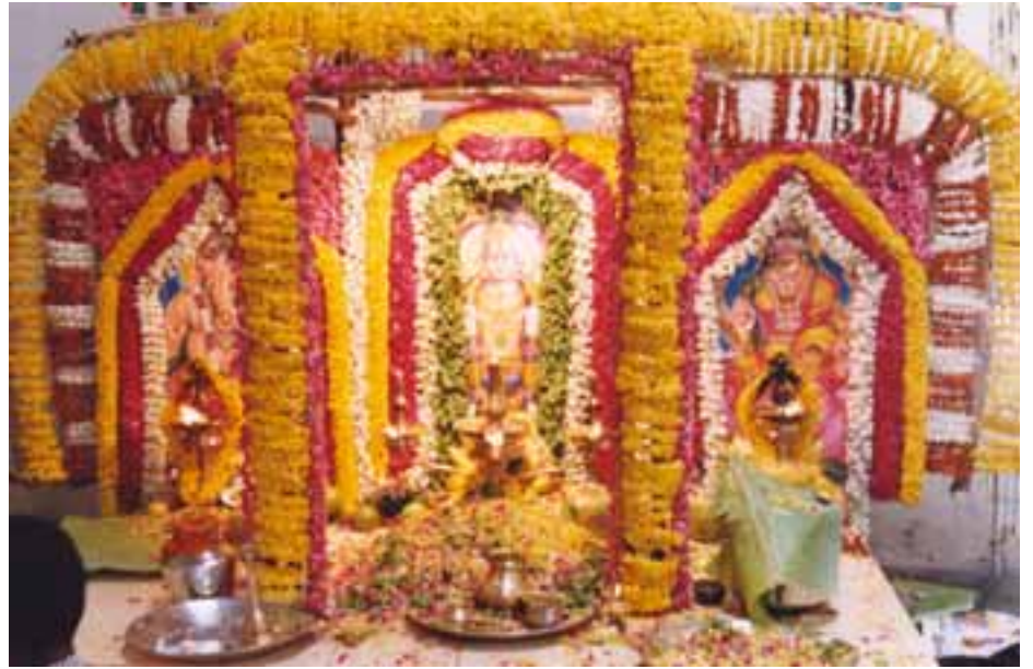
A pre-trip puja.

With the pilgrimage over, went to Ernakulam where we had a traditional meal around 1 pm. We chilled out with some ice creams while waiting for the train. We boarded the train at 4.10 pm. Some of us merrily sang away a medley