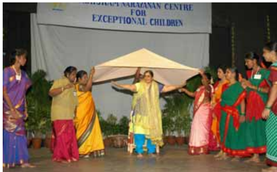
Parents of MNC children.